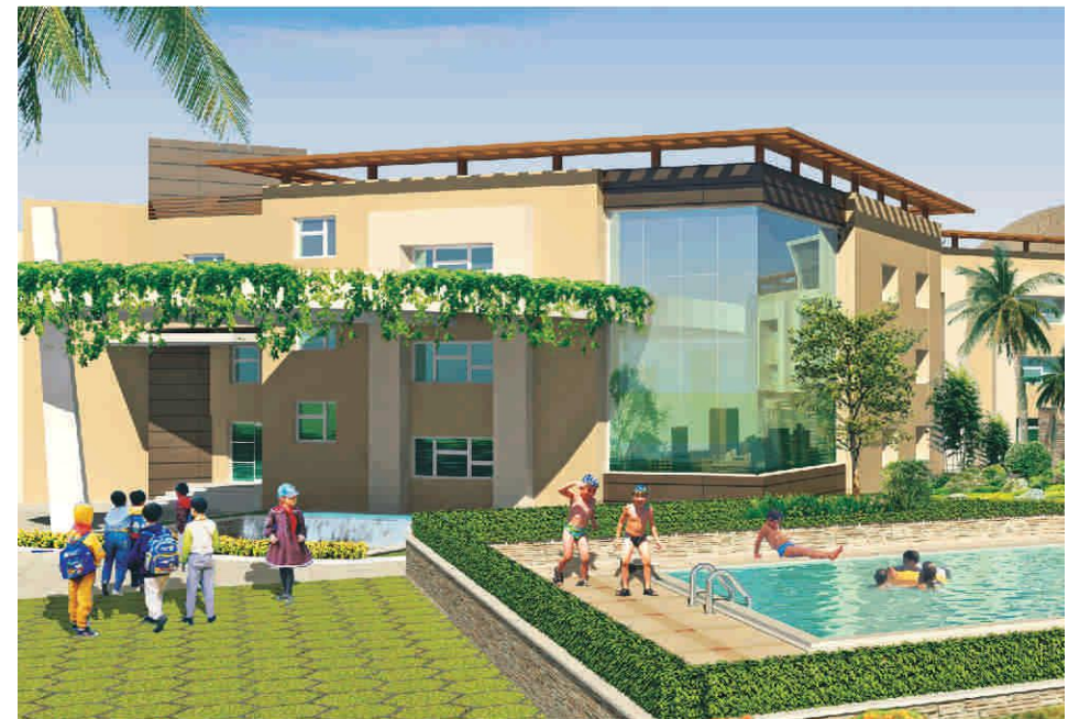
THE NOBLES LEAGUE (K-12 SCHOOL, AGRA)