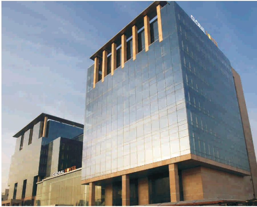
GLOBAL FOYER - GURGAON