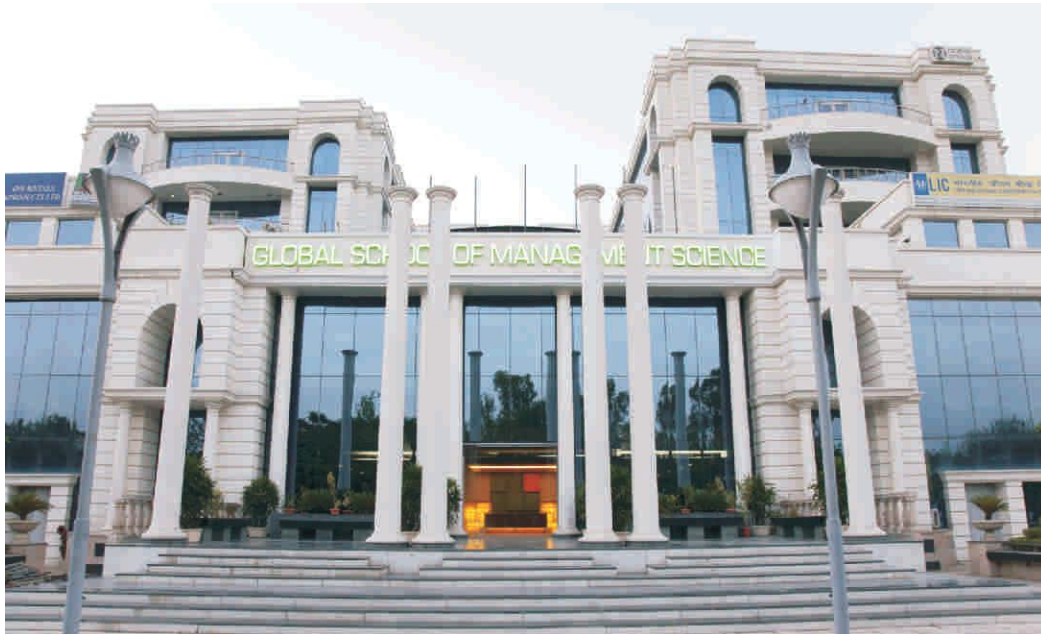
GLOBAL SCHOOL - DELHI