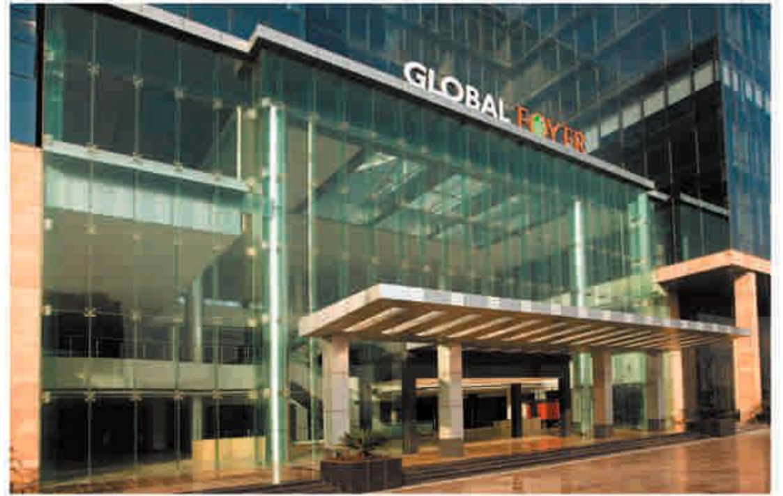
GLOBAL FOYER - GURGAON