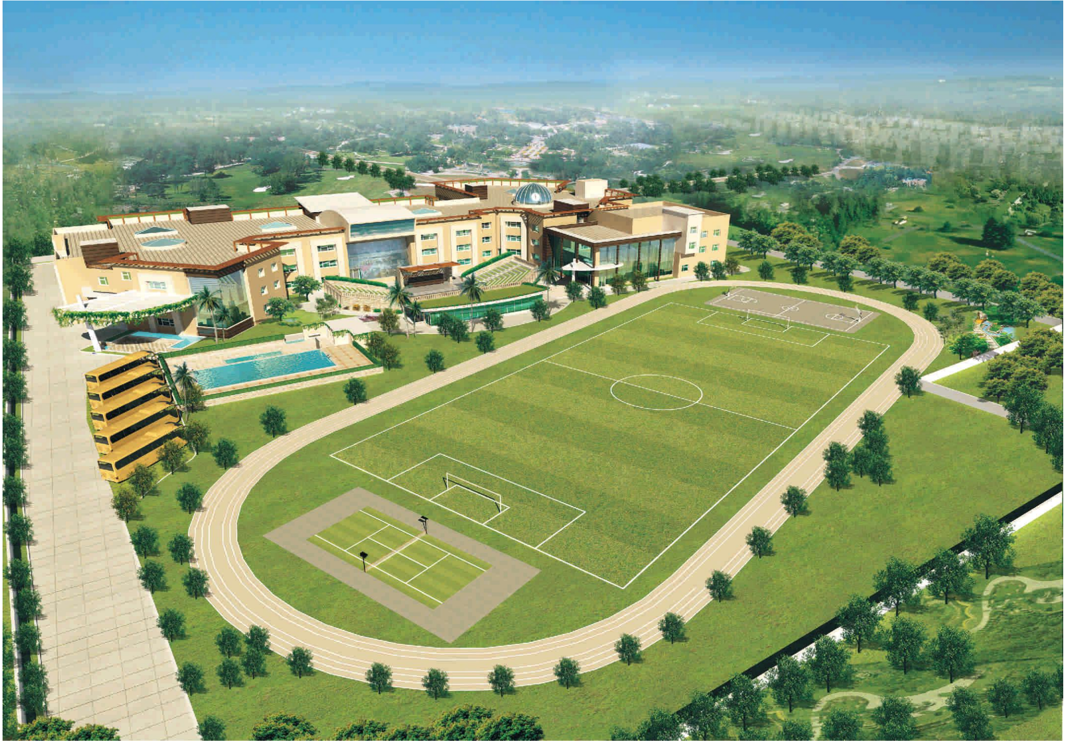
THE NOBLES LEAGUE (K-12 SCHOOL, AGRA)